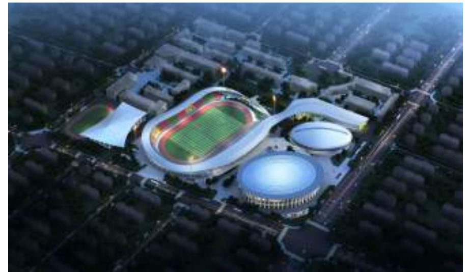
Linping Sports Centre Gymnasium