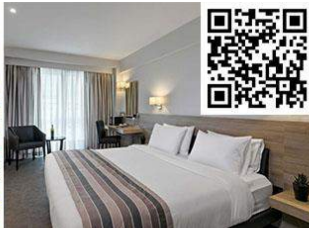
1 Odisseos str, Karaiskaki Square, 10437 Athens – Greece