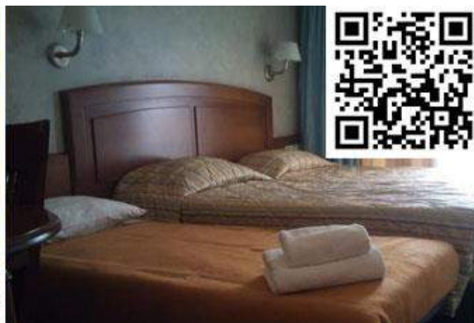
4 Achilleos str, 104 37 Athens – Greece