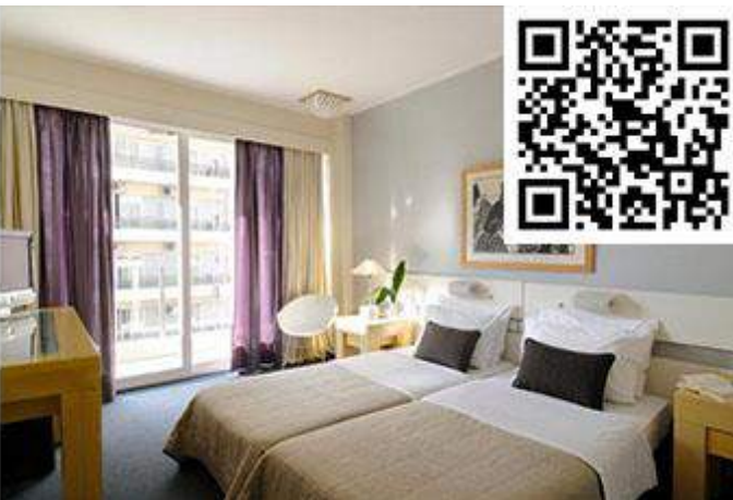
15-19 P. Tsaldari St. (Pireos), Athens